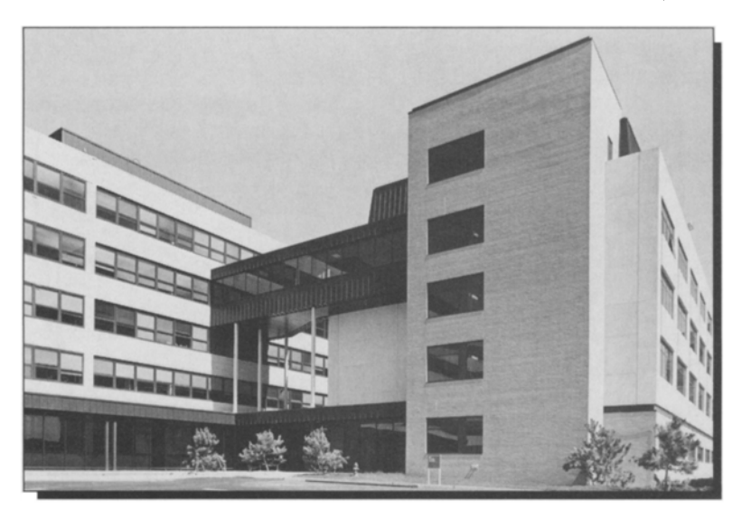
Lever's R&D center in Edgewater, New Jersey, is one of Unilever's four principal laboratories worldwide.

The resulting expansion project, completed in 1985, cost more than $50 million and increased laboratory space and the scientific staff